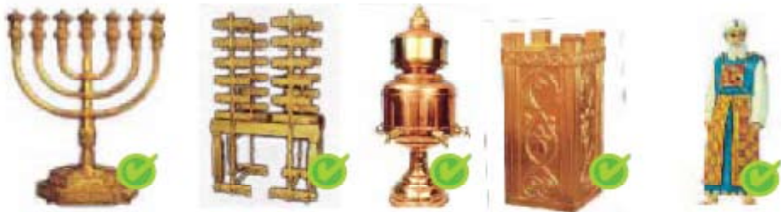
התמונות (והכלים) באדיבות מכון המקדש

From Daf Habayit, a weekly section on the Temple Mount in Makor Rishon , December 22, 2011: