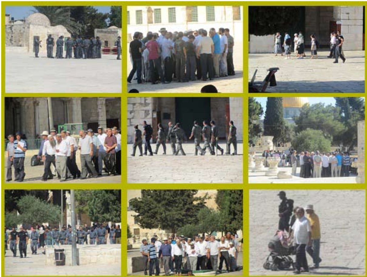
Pictures of groups of pilgrims, rabbis and soldiers in uniform, published on Arab websites

In recent years, the Islamic press has frequently reported on groups of uniformed Israeli soldiers entering as tourists and touring the Mount complex. Such acts are seen as an Israeli provocation and an attempt to change the arrangements in force on the Mount, according to which Israeli security forces are allowed to enter the complex only to protect order and security. On August 28, the Al-Aqsa Institute of Waqf and Heritage issued an official statement accusing Israel of violating the sanctity of the Al-Aqsa Mosque by allowing the very presence of non-Muslims at the site. According to the statement: