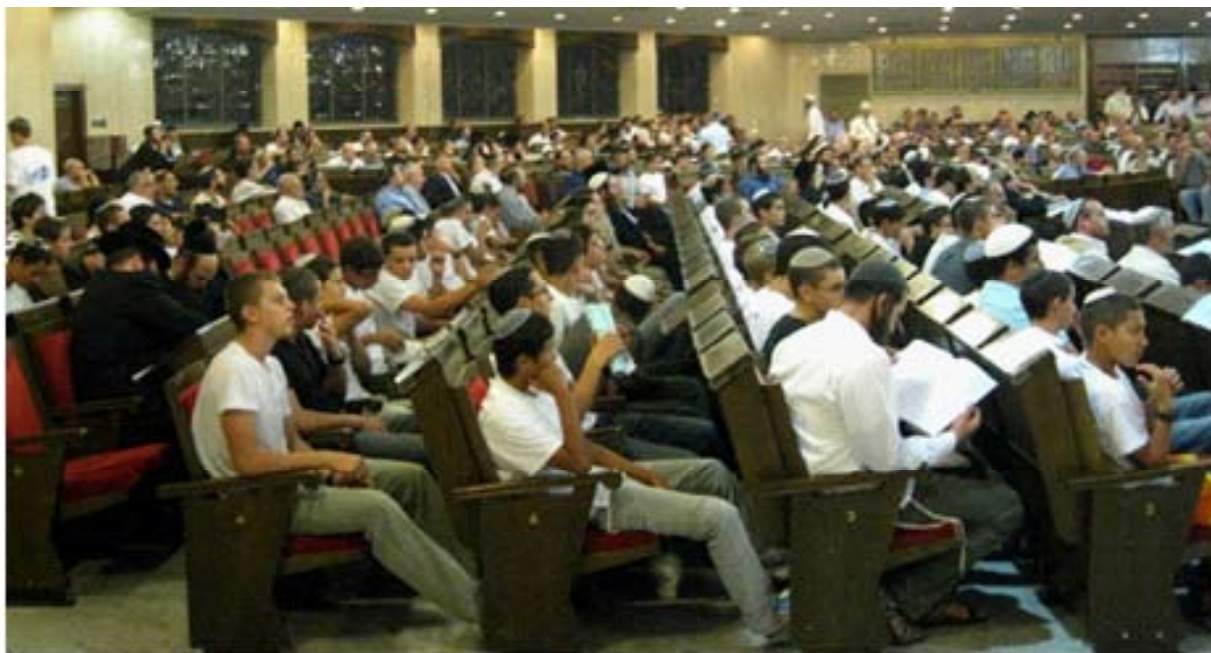
The audience at the 12th Temple conference at the Great Synagogue in Jerusalem.

The 12 th Temple Conference convened in September 2011 at the Great Synagogue in Jerusalem was held under the auspices of Makor Rishon , the daily newspaper identified with the national religious sector. 92 According to the Arutz Sheva website, the conference focused on "the conquest, Judaization and purification of the Temple Mount; removing the